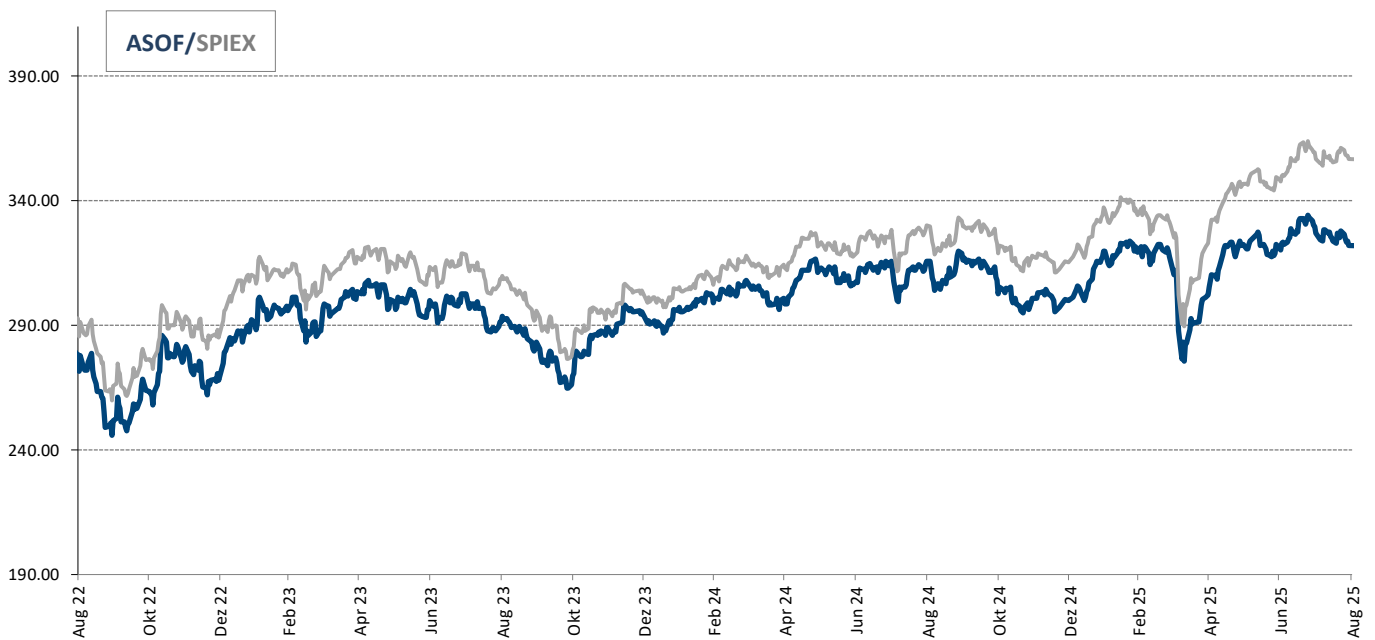
NET-PERFORMANCE SINCE 31.08.2022 (VS SPIEX )

derma (9.51%) and Sandoz (7.77%) in the fund's portfolio. Our underweight in Lindt & Sprüngli (1.75%) was a negative factor too. The disappointing performance of Comet (-17.9%) and VAT (-9.26%), two stocks that were only recently added to the portfolio, didn't help either. What are our expectations for the remainder of the year? Although markets have so far shrugged off numerous risks and uncertainties and taken their cue instead from the prospect of lower central bank rates, it's hard to sit back and enjoy this market ride. It's more like a highwire act than a smooth and relaxing drive. Which is why our stance is basically the same as it was last month. The negative impacts of disruptive government policies on the general economy and company profits will probably not be visible until the coming quarters. Not until then will we know whether the stock market was right to dismiss any suggestions that the new trade policies coming out of Washington could have a negative impact on the economy. We remain skeptical and expect higher levels of volatility in the coming weeks.